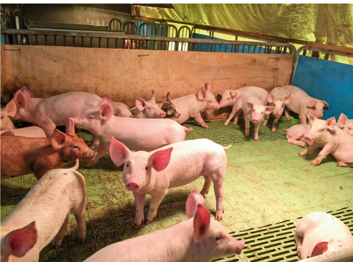
Pictures: Group 'A' (left) and 'C' (right). Depression, reduced weight gain and coughing were main symptoms in group 'A' in the nursery but no more in group 'C'.